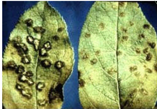
Apple scab lesions on apple leaves.

The first visible symptoms are small, discrete, olive to greenish-black lesions on the underside of the leaves. Lesions are about 1/4" in diameter with an indefinite feathery margin. The infection tends to be on the underside of the leaf, later in the season the spots can be seen on either side. Leaves with large numbers of lesions often become distorted, show dead or dying tissue, yellow, and prematurely drop from the tree.