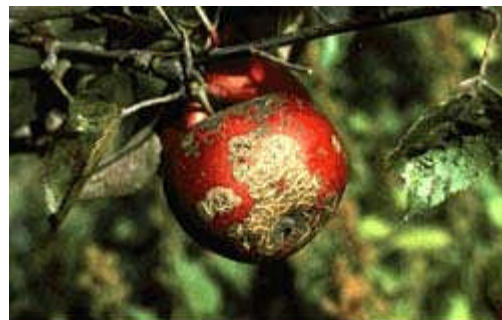
Apple scab lesions on fruit.

Lesions on the fruit are superficial, the unblemished portion is not affected and is safe to eat. Gordon's Multi-Purpose Fungicide is the spray Doctor's Lawn & Landscape recommends to use on apple scab. Six or more sprays are advised at 7-10 day intervals from pre-pink through rainy cool periods of the growing season. If it rains within 6 hours of spraying, you should re-spray as the fungicide will be washed off before it can work.